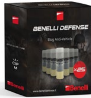
3 Slug Anti-Vehicle