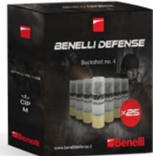
5 Buckshot no.4