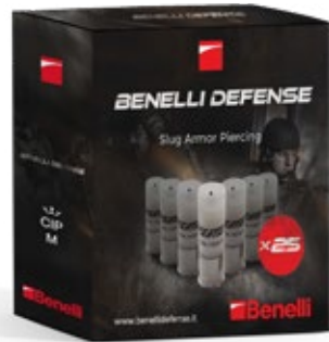
2 Slug Armor-Piercing