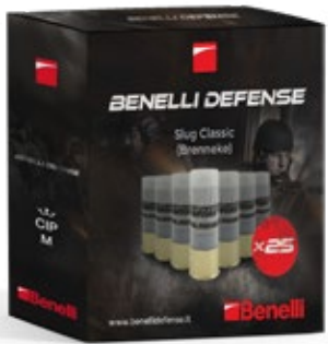
1 Slug Classic Brenneke