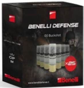
4 00 Buckshot