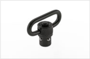
QD SLING SWIVEL