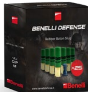
6 Rubber Baton Slug

1. Slug Classic Brenneke (3 times the stopping power of a 5,56x45 NATO and 2 times a 7,62x51 NATO or 7,62x39 Russian);