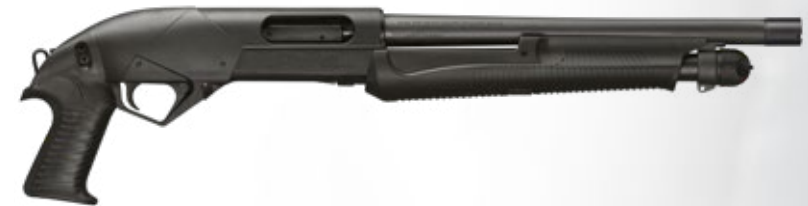
14" TELESCOPIC STOCK