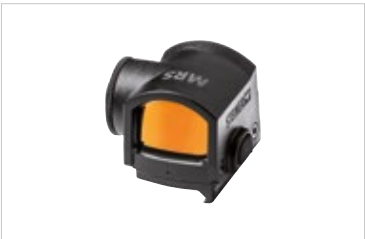
REFLEX SIGHT RED DOT