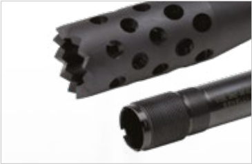
DOOR-BREACHER AND ADAPTOR