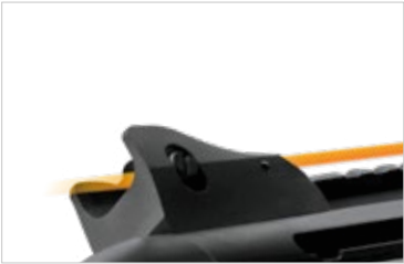
FIBER OPTIC GHOST RING SIGHT