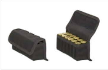
AMMO POUCH MOLLE SYSTEM