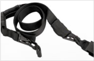
3 POINTS SHOTGUN STRAP